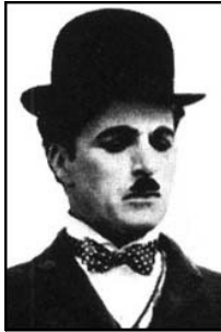
Ask Sober Man

There is no such thing as Ask Sober Man. It is just a reminder that we could have a monthly column published here with questions, answers, comments or scheduled events in the Austin area. We would love to have someone involved in carrying out this important job. It has been a wish of ours for several years now.