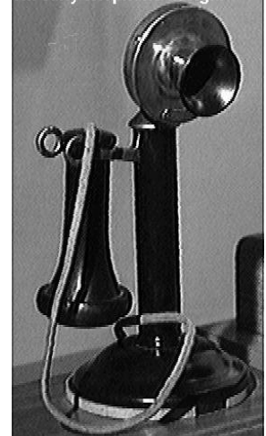
An early telephone design.

Twelve step calls, Literature sales, Friendly conversation, Coffee, Come by and sign up!