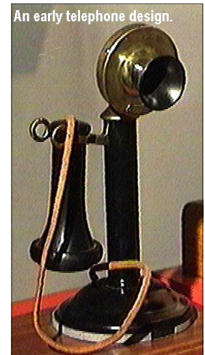
An early telephone design.

Twelve step calls, Literature sales, Friendly conversation, Coffee, Come by and sign up!