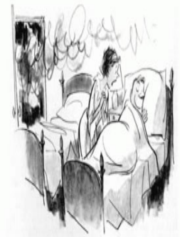
"I know you don't want anything to upset your serenity dear, but the house is on fire."

Old-timer:"Probably an olive. But never mind—whatever works!"